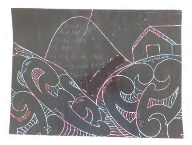
FIGURE 3. STUDENT WORK IN PROGRESS

Many of the students in Paddy's class came from families that have migrated from other parts of Aotearoa or the Pacific. Over the course of the unit, some students developed a more informed awareness of the physical environments from which their families had migrated. Completing their pepeha meant students found out the names of mountains, bodies of water and other elements of the land that are significant to their whanau (see for example Figure 3 where the student has incorporated these elements into the composition). Paddy asked them to find images of those actual places so that they could