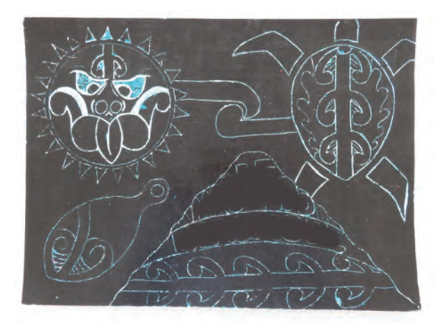
FIGURE 2. STUDENT FINAL ARTWORK

Enviro-cultural literacy involves recognising, selecting and applying available cultural forms and practices for cultural and environmental effect. On reflection, the ecological focus of this dimension of literacy could have been extended by building on the whole-class activity described above. For example, providing photos of actual