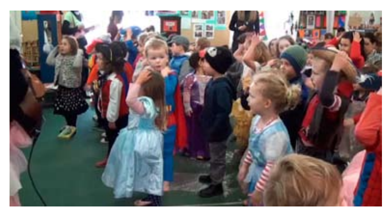
Songs at the St Andrew's community event