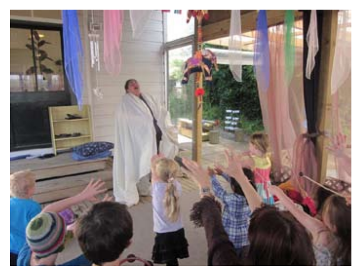
Ghost story at Helensville Montessori

The project as it evolved was very much about the children, teachers, and parents together—the pathway of performing arts learning became a community experience expressed through shared ownership. The learning pathways tended to be improvisatory in that they depended on a responsiveness to the evolving interest and movement of the group.