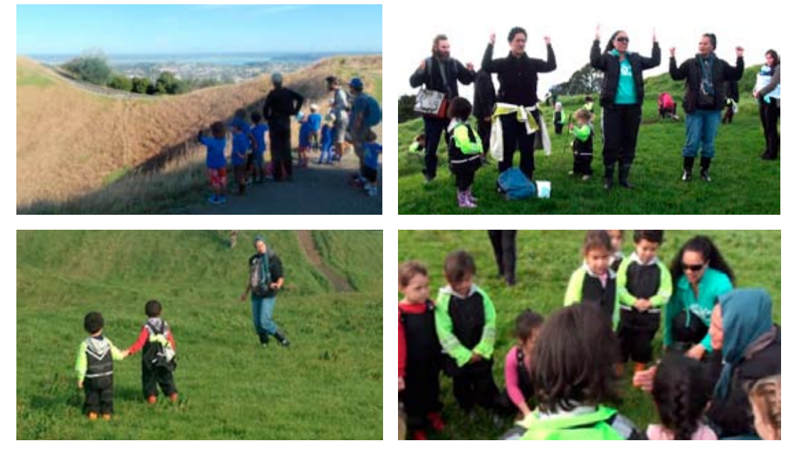
Te Puna Kōhungahunga on the Maungawhau hikoi

The mokopuna jumped back from the flames imagined, making appropriate squeals, warnings to each other, verbal and other non-verbal bodily utterances. Eyes were wide open. Bodies already anticipating further movements in the event they were creating with their kaiako. Our kaiako swept her arms around a circular area to sit amidst the green space. The presence of the maunga [mountain] is sensed and of the place that shared narrative holds in this collective becoming, living literally and imaginatively, as Māori atop this maunga in the middle of the city which transverses their everyday urban experiences. (Fieldnotes of Te Puna Kōhungahunga walking performance as community event atop Maungawhau, Mt Eden, 22 June 2013); originally in te reo Māori, revisited through reference to the video record in Moodle, and this section subsequently rewritten as the above narrative.)