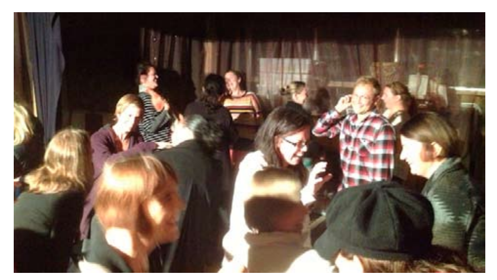
Parent dance evening in the gazebo

The parents were an enthusiastic bunch, but some were a little reticent at first. However, the collective presence of the whole group participating together helped ease them into the action, and Adrian became more focused with his movement invitations as time went by. A move into pairs and threes encouraged interaction. The session ended with a still group tableau, and Adrian asked for a volunteer to begin a group sequence of still shapes—each new parent entering the group with an additional shape in response to the group. One enthusiastic mum came forward and struck up an expressive pose. Her gesture was dramatic and without fear and this inspired others to join in with equal enthusiasm, each new parent finding a still space in response to the emerging group shape.