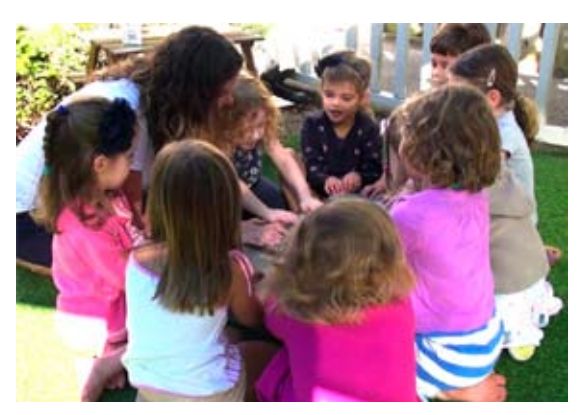
Sharing sound ideas at St Andrew's